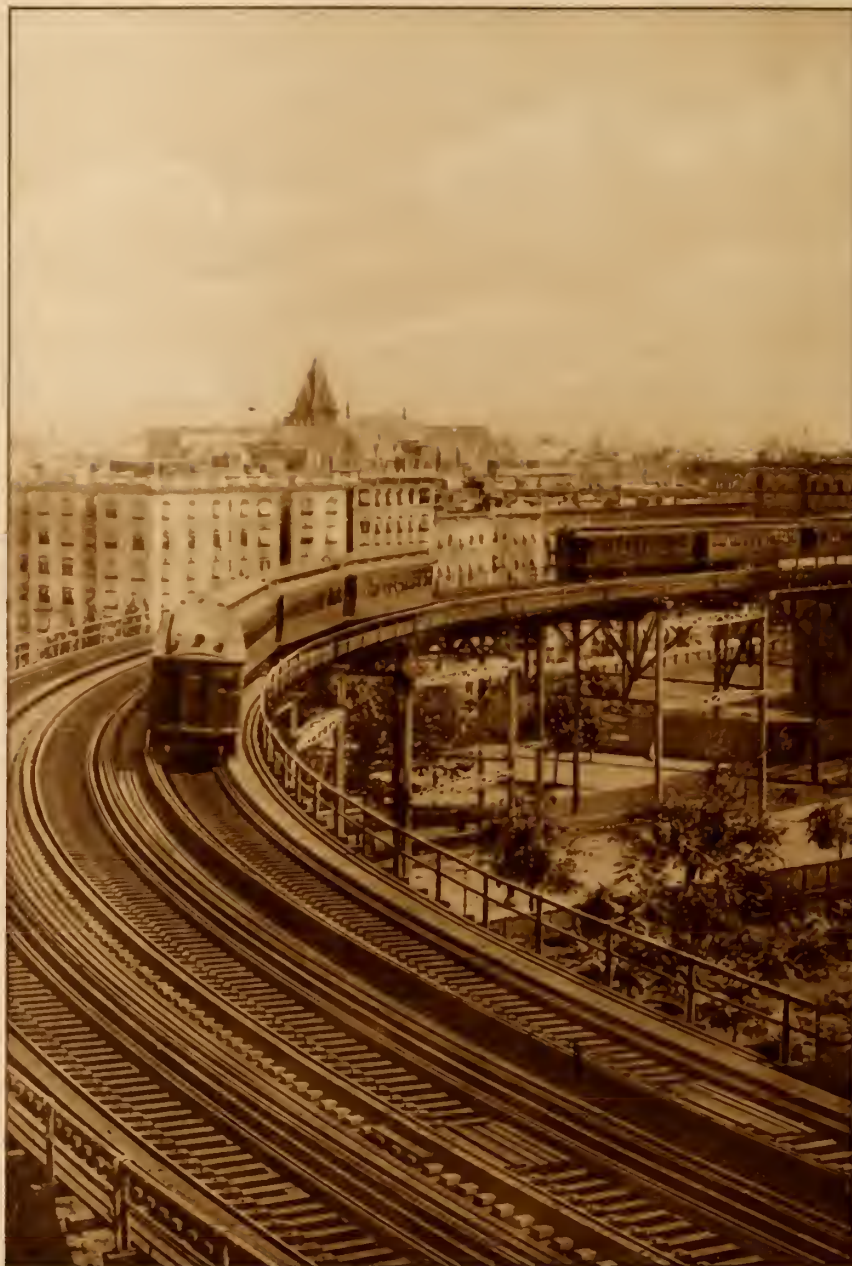
VIADUCT OF THE ELEVATED RAILWAY AT 110th STREET, 73 feet above the level of the street. It is the highest point in the elevated train system.